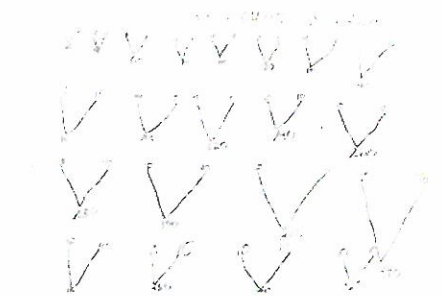
b. Their recording of moving the chains two at a time from the table to the floor

record the numbers they can count to. We watch to see if anyone is counting by twos or grouping objects into tens.